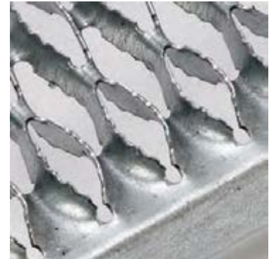
Relief hole available upon request on 3, 4, & 5-diamond planks